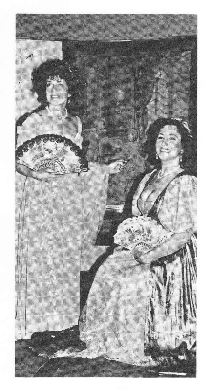
A scene from Which is the Man?