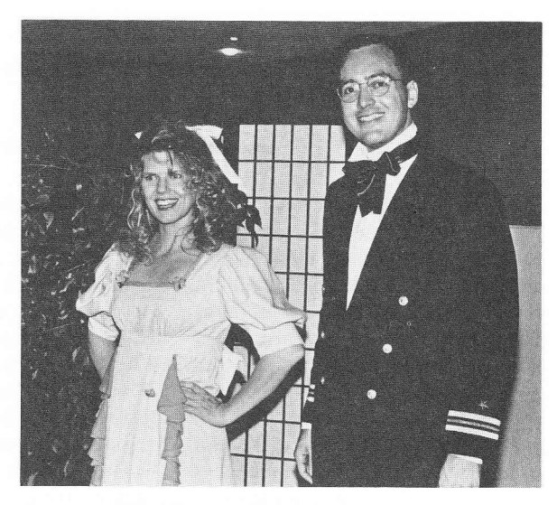
"These would have been all my friends . . ." A charming couple.