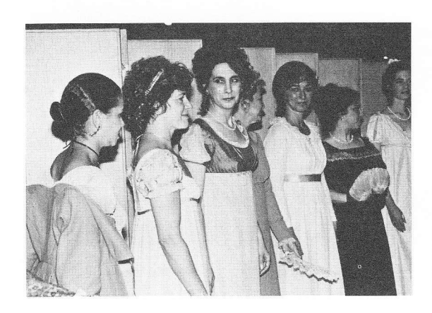
"Oh! she is the most beautiful creature I ever beheld!" Several beautiful creatures modelling the fashion show.