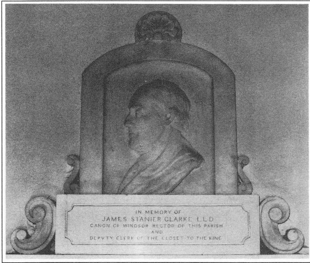
The photograph of the memorial tablet in Tillington Church.